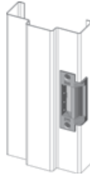
Specially designed to accommodate 2" fire-rated frames