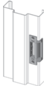
Specially designed to accommodate 2" fire-rated frames