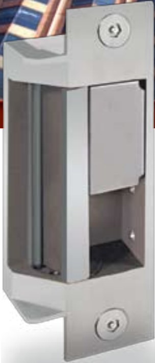
shown with mortise tab option