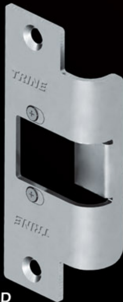
478-32D *NEW* Patented horizontal adjustment feature -- Guarenteed not to move!