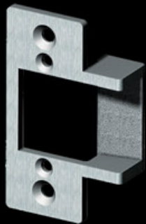
234-26D Smallest electric strike faceplate in the world!

SIZE ADJUSTABLE, VOLTAGE SELECTABLE, ALWAYS DEPENDABLE