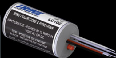
30LC This Model utilizes an external line conditioner (LC100) module to regulate input voltages, 11-28 AC or DC (More Info on Back)