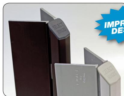
Hospital tip end caps available in black or gray.

Find more hospital tip information and specs at select-hinges.com/select-hospital-tips .