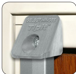
Tipit available in two sizes, in black or gray.