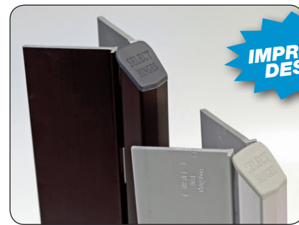
Hospital tip end caps available in black or gray.

Find more hospital tip information and specs at select-hinges.com/select-hospital-tips .