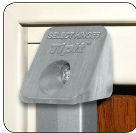
Tipit available in two sizes, in black or gray.