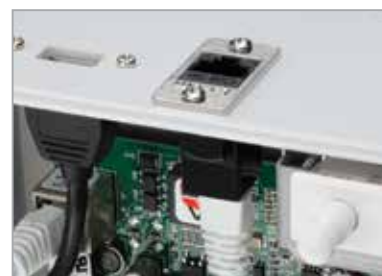
PIM400-1501 has RJ-45 and USB external connectors to make installation easy.