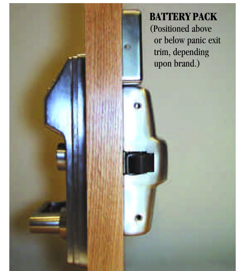
BATTERY PACK (Positioned above or below panic exit trim, depending upon brand.)