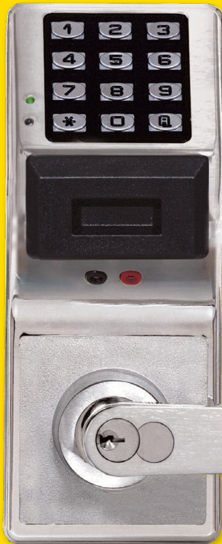
PDL5300IC Prox/PIN Lock front/back view, shown

Double-sided Trilogys for PIN code or prox access from 2 sides of the door