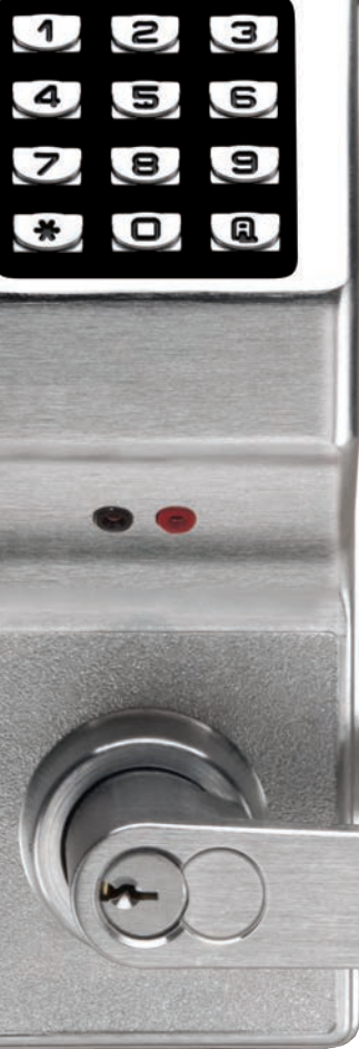
DL5300IC PIN Lock Front/Back View, shown