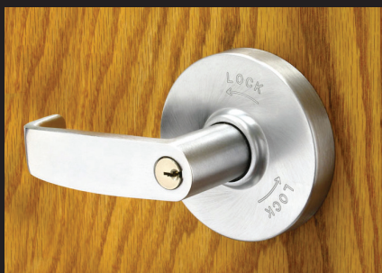
Arrows show direction to turn the key on bored locks (Classroom Security Intruder function)