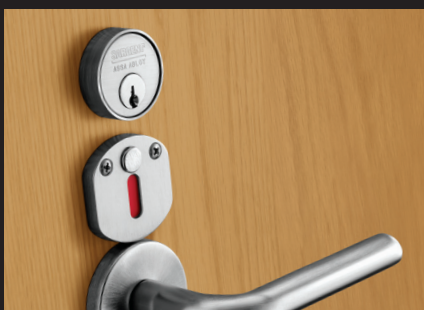
Red indicator clearly displays locked/unlocked on mortise locks (Classroom Security Intruder function)

School administrators and facility managers have a new primary responsibility: making sure their learning environment is safe and secure. The need to keep unauthorized individuals out without inhibiting the daily freedom of movement of students and staff is of the highest priority. There are several schools of thought on how locking solutions can help accomplish this.