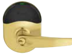
606 - Satin brass