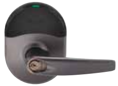
643e - Aged bronze