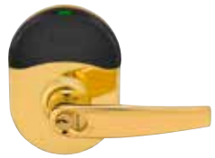
605 - Bright brass