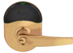
612 - Satin bronze