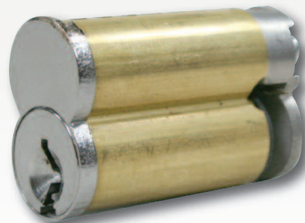
7 PIN POINTE SLIDING DOOR INTERCHANGEABLE CORE

Our precision engineering design, keying capability and availability make Arrow Pointe interchangeable cores our most specified brand for commercial, industrial and institutional applications.