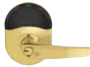
606 - Satin brass