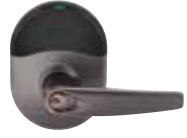
643e - Aged bronze