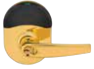
605 - Bright brass