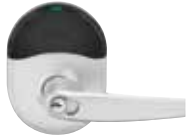
626 - Satin chrome