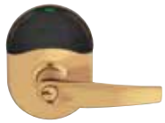
612 - Satin bronze