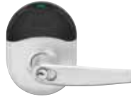
626AM - Satin chrome with antimicrobial