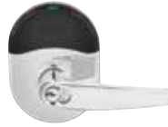
625 - Bright chrome