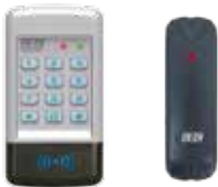
920 IPRW Wiegand Access Control Keypad or Reader