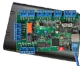
IPPro IP-based Access Control Controller