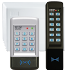
921P & 924P