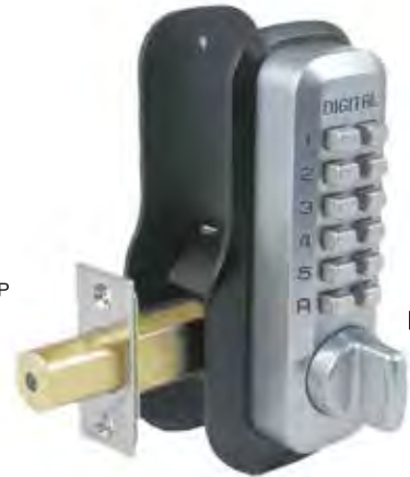
M210 WITH EZ PLATES

FINISHES: AB | BB | SC | SN | JB | WH | OB | BC | MG