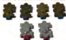
EXTRA COMBINATION TUMBLERS