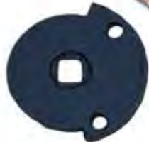
TB950 - 180° DRIVE PLATE ORDER #: TB950-180 PLATE

GATE WIDTH: 32-52 IN. GATE WEIGHT: 50-250 LBS. OPENING ANGLE: 90 DEGREES MIN. OPERATING TEMPERATURE: -40° F