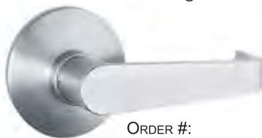
Lever Handle Passage Trim