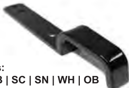
C-SERIES PULL HANDLE