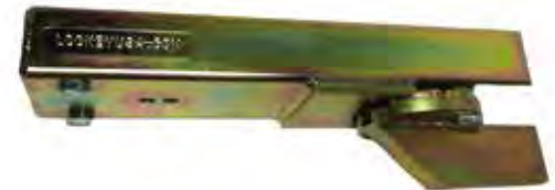
ORDER #: TB950 MAGNUM