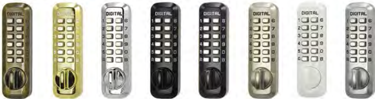
Antique Brass (AB) US-5 Bright Brass (BB) US-3 Bright Chrome (BC) US-26 Jet Black (JB) Oil Rubbed Bronze (OB) US-10B Satin Nickel (SN) US-15 White (WH) Satin Chrome (SC) US-26 & Marine Grade(MG)*

* Many products are offered in the Marine Grade (MG) finish, which is designed to extend the lifetime of the finish when exposed to corrosive elements of saltwater environments. It closely resembles the Satin Chrome finish.