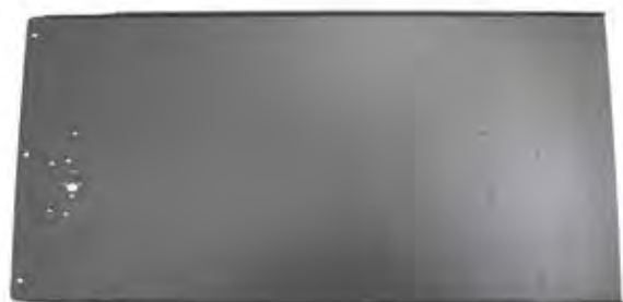
PS11-SECURITY - SILVER