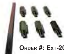
C-SERIES EXTENSION KIT