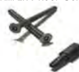
TAMPER PROOF SCREWS