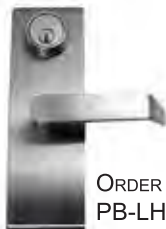
Lever Handle Clutch Trim