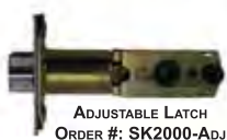
ADJUSTABLE LATCH ORDER #: SK2000-Adj