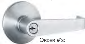
Lever Handle Keyed Trims

ORDER #'S: KEYED ENTRY: PB-LHED STOREROOM: PB-LHSR