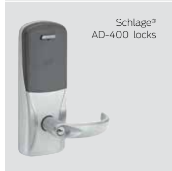
Schlage® AD-400 locks