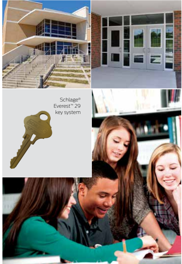
Schlage® Everest™ 29 key system

Note: These security solutions are designed only as a guide and do not take into consideration local codes and regulations that may be in place. Please contact your local Alliegion representative to design a specification to meet your unique needs.