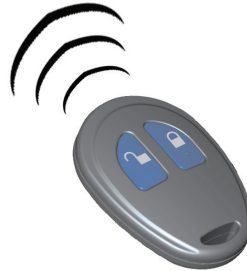
Remote Control (sold separately)