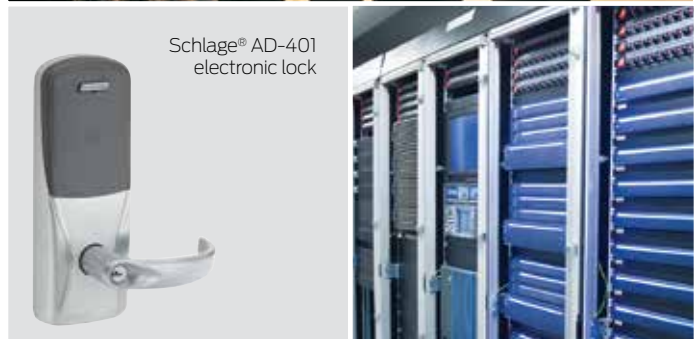
Schlage® AD-401 electronic lock