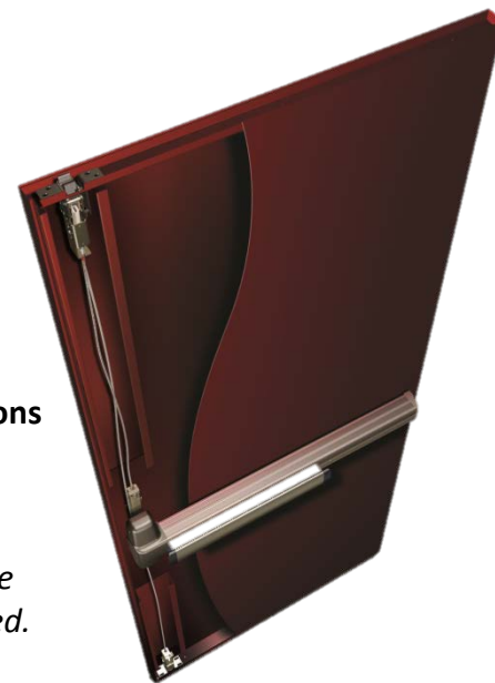
L-Series Door with CVC Preinstalled

* Steelcraft pre-installed CVC solution is available on the following door series: L, B, T, and CE