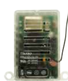
433MHz 1 Channel Nano Receiver

For Remote Control Versatility for Touch Panel Column and Push Plate Switches. 75 foot wireless range. less barriers.