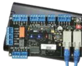
IPPro IP-based Access Control Controller