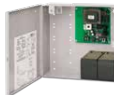
602RF 1 Amp, 12/24 VDC Class 2 Output Power Supply