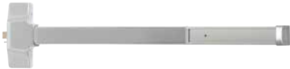
ED1000 Series Grade 1 exit devices