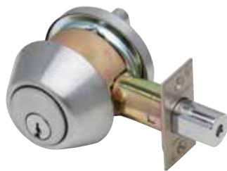
DB1000 Series Grade 1 deadbolt