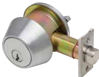
DB2000 Series Grade 2 deadbolt