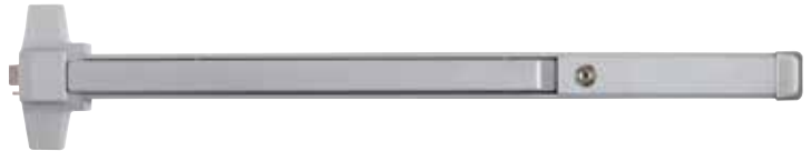
ED2000 Series Grade 1 exit devices