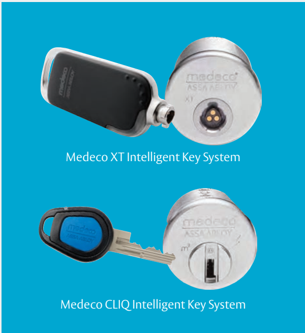
Medeco XT Intelligent Key System

A key can be given a short authorization time-window, say 9:00 a.m.–5:00 p.m., thus minimizing risks associated with lost keys or changes in personnel. Security managers can also generate time-stamped audit trails for any lock or key, trace access workflows, or use a visual audit dashboard to see at-a-glance information on the full system.