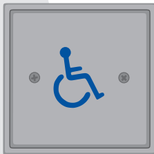
#59-WSS (Stainless Steel with Blue Paint Filled Legend)