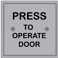
#59-P (Stainless Steel with Black Paint Filled Legend)