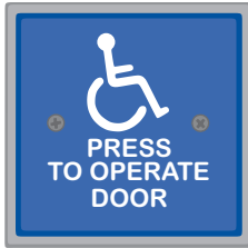
#59-H (Blue Powder Coat with White Paint Filled Legend)