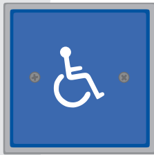
#59-W (Blue Powder Coat with White Paint Filled Legend)