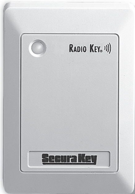
RADIO KEY® RK-WS

Radio Key® RK-WS Proximity Reader is designed to integrate into any system requiring a Wiegand output. The reader will read Secura Key proximity cards or key tags and transmit the data in virtually any Wiegand Format up to 40 bits.