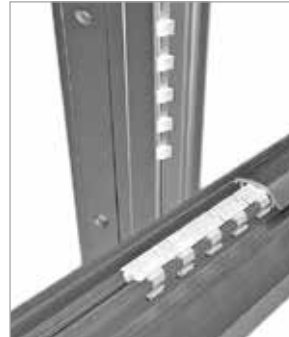
FOCUS™ centralized bearing system