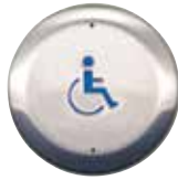
Stainless steel 4 1/2" Round style push plate