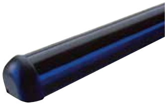
Door mount Safety sensor