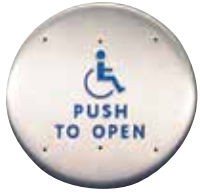
Stainless steel 6" Round style push plate