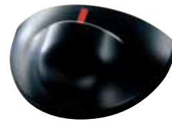
Header mount Activation sensor