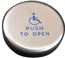
Stainless steel 6" Slim profile push plate