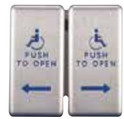
Stainless steel Dual jamb style push plate