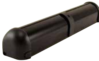
Header mount Safety sensor