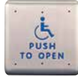
Stainless steel 4 3/4" Square style push plate