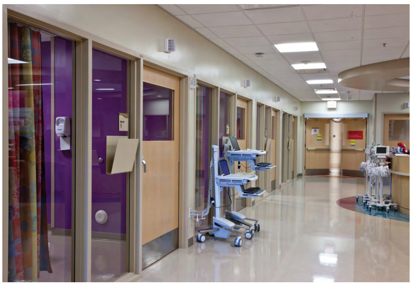
Phoenix Children's Hospital