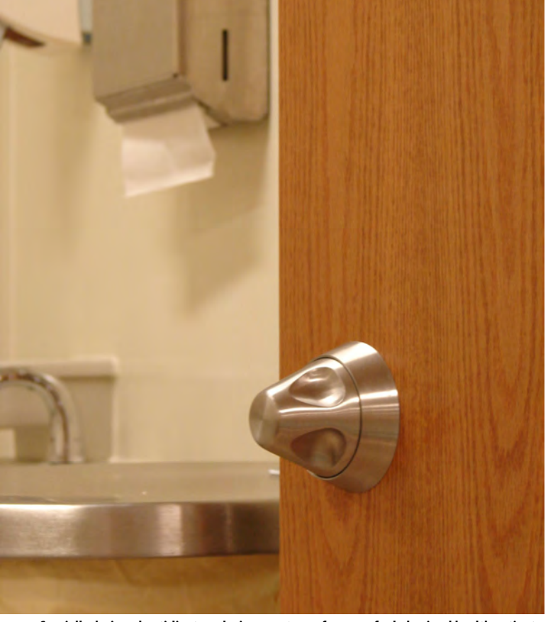
\label{lem:continuous} \textbf{Specially designed anti-ligature devices create a safer space for behavioral health patients.}