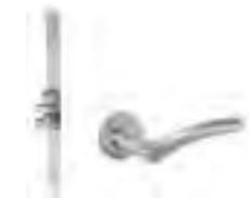
Schlage L Series mortise locks Grade 1

Schlage L Series locks have long been the industry standard for mortise locks, with a comprehensive offering of functions and options to support any opening need.