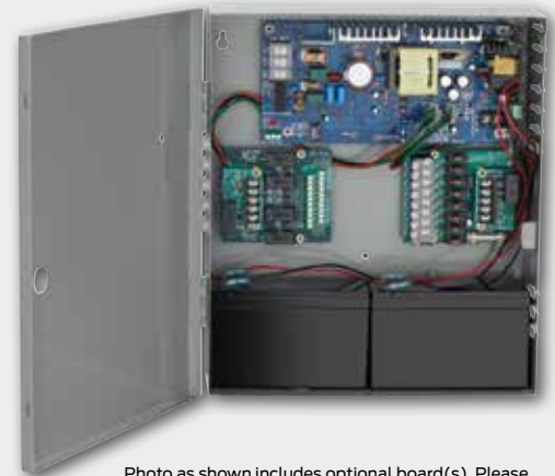
Photo as shown includes optional board(s). Please contact your local sales office or visit the support section on our website for configuration assistance.