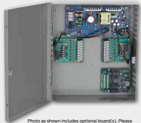
Photo as shown includes optional board(s). Please contact your local sales office or visit the support section on our website for configuration assistance.