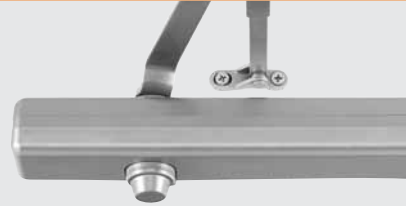
1460 MEDIUM DUTY CAST IRON