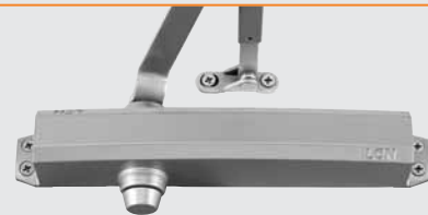
1450 MEDIUM DUTY CAST ALUMINUM