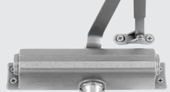
1260 LIGHT DUTY CAST IRON