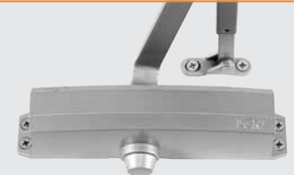
1250 LIGHT DUTY CAST ALUMINUM