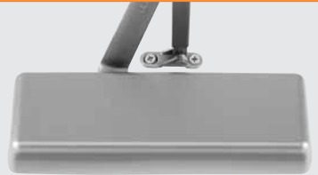
4040XP HEAVY DUTY CAST IRON