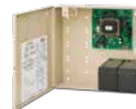
631RF 1.5 Amp, 12/24 VDC Class 2 Output Power Supply