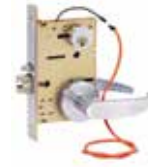
Z7850 x REX x DPS Electrified Mortise Lock