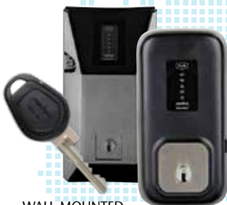
WALL-MOUNTED OUTDOOR PROGRAMMING STATION REMOTE WALL PROGRAMMING DEVICE