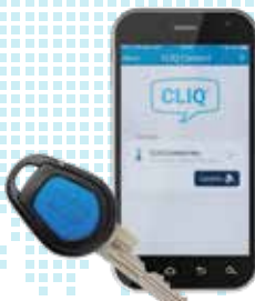
CLIQ CONNECT BLUETOOTH ENABLED KEY