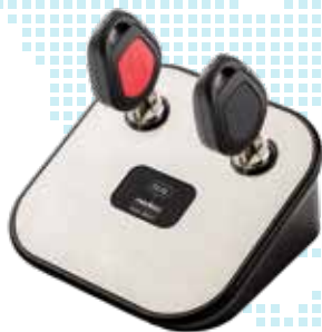
LOCAL PROGRAMMING & AUDIT